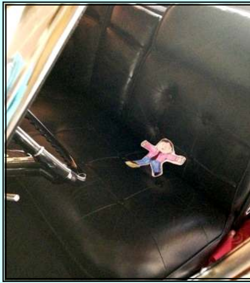
Trying to drive the car but realizing he is too short. (Flat Stanley, that is, not Rob!)