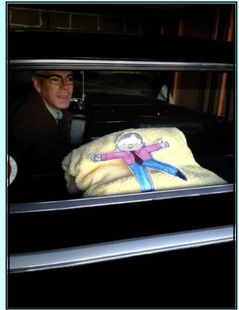
Playing on the package shelf.