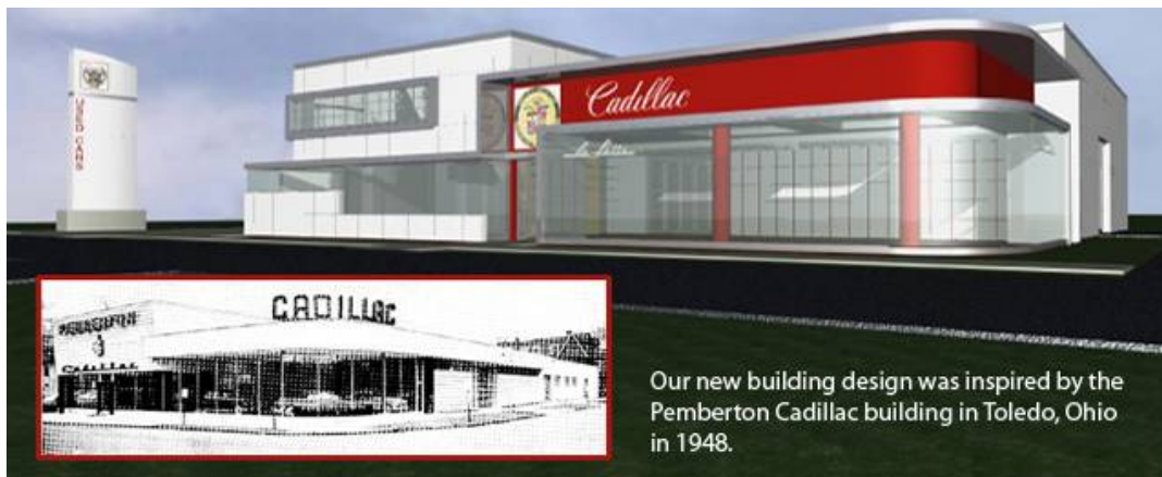
Our new building design was inspired by the Pemberton Cadillac building in Toledo, Ohio in 1948.

Approval was also given by the board to authorize the contractor, Groves Construction, to proceed with producing a firm contract and build