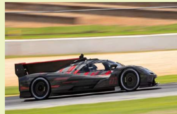
The racing Cadillac V-LMDh in testing