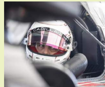
At RIGHT, Kiwi Earl Bamber during Cadillac testing