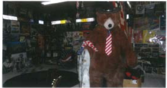
Our Man Cave